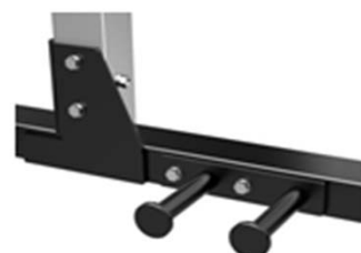
Anchor for elastic bands